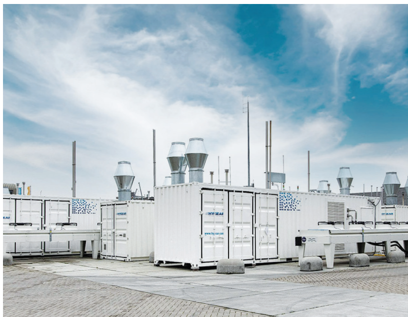
On-site Renewable Hydrogen Generation

Industrial Air & Gas Filtration Hydrogen Nitrogen Specialized Gas Purification Biogas Oxygen Compressed Natural Gas Compressed Air Cleantech